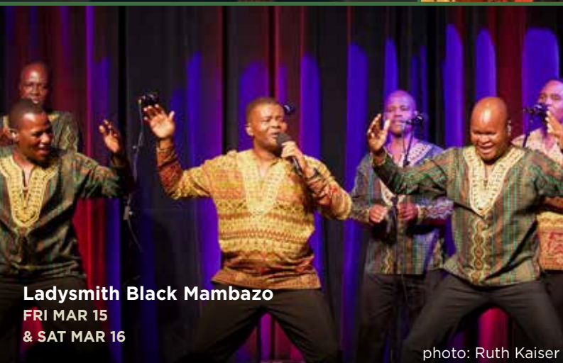
Ladysmith Black Mambazo FRI MAR 15 & SAT MAR 16