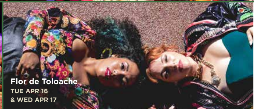
Flor de Toloache TUE APR 16 & WED APR 17